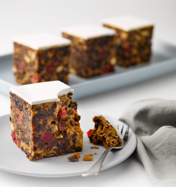
Christmas Cube traditional recipe iced cake 2.5 inch | $15.00