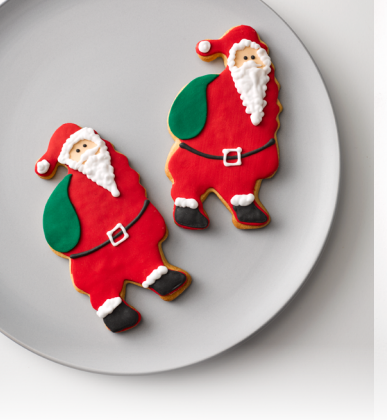
Shortbread Santa iced shortbread | $5.00