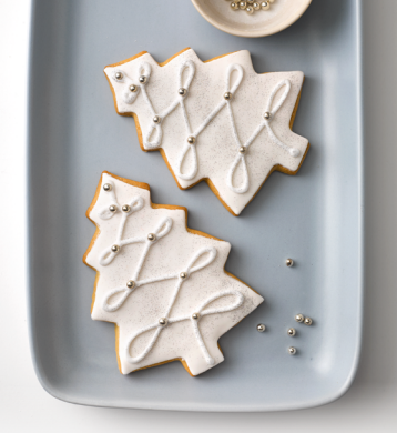
Shortbread Tree iced shortbread | $4.50