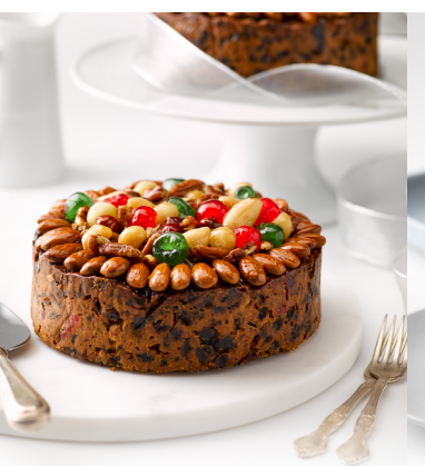
Fruit cake round fruit cake with glazed cherries and nuts 7 inch | $59.00