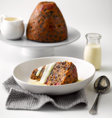
Christmas Pudding 500g | $42.00