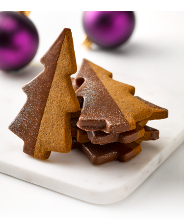
Gingerbread Tree chocolate dipped gingerbread | $3.90